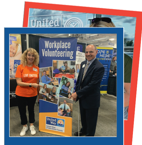
Literacy Kits for families