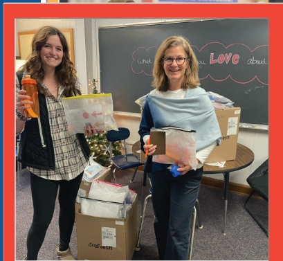
Calm Kits for students

"I was able to bake with my grandchildren because of the wonderful basket I received. Thank you for allowing us to make memories."