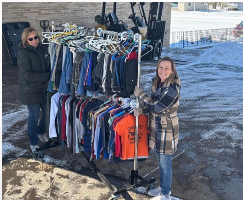
AbbyBank employees generously volunteered at all Abbotsford stops.

The Mobile Community Closet expanded access for families facing transportation or geographic barriers and helped ensure support reached households across the community, meeting them in places they already spend their time, like schools and other social service providers.