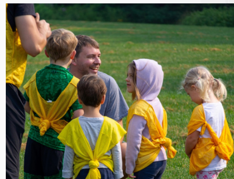
Woodson YMCA was one of the recipients of an Otto Bremer Trust Community Responsive Fund grant in 2025.

The six nonprofits that received funds were the Boys & Girls Club of the Wausau Area, Marathon County Literacy Council, Bridge Community Health Clinic, The Women’s Community, Wisconsin Judicare and Woodson YMCA.