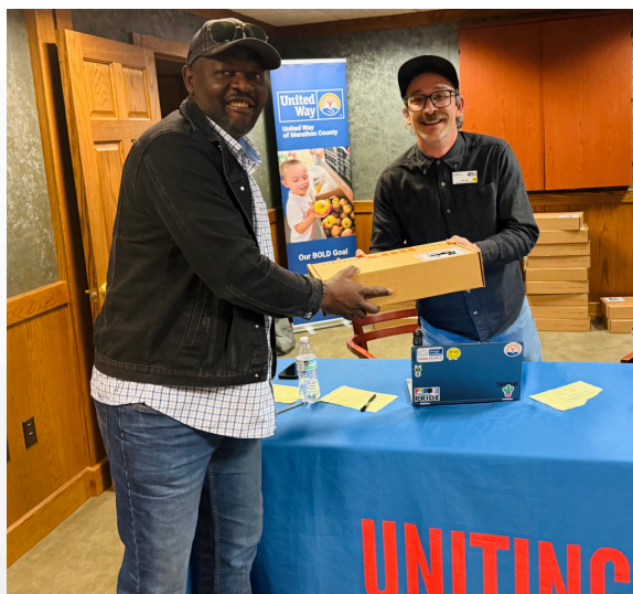
The first distribution event was held at ECDC Multicultural Community Center where 75 were given out.

Additional distribution events took place at The Neighbors' Place, Community Partners Campus, and Marathon County Social Services.