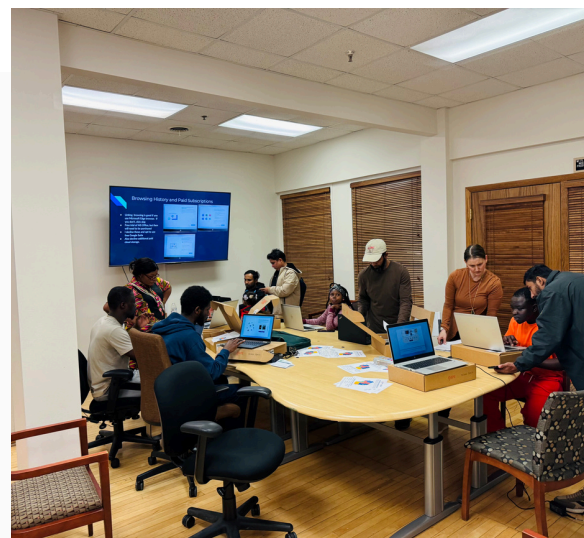
Recipients also received help with setting up their laptop as well as introductory lessons on how to navigate their new device.